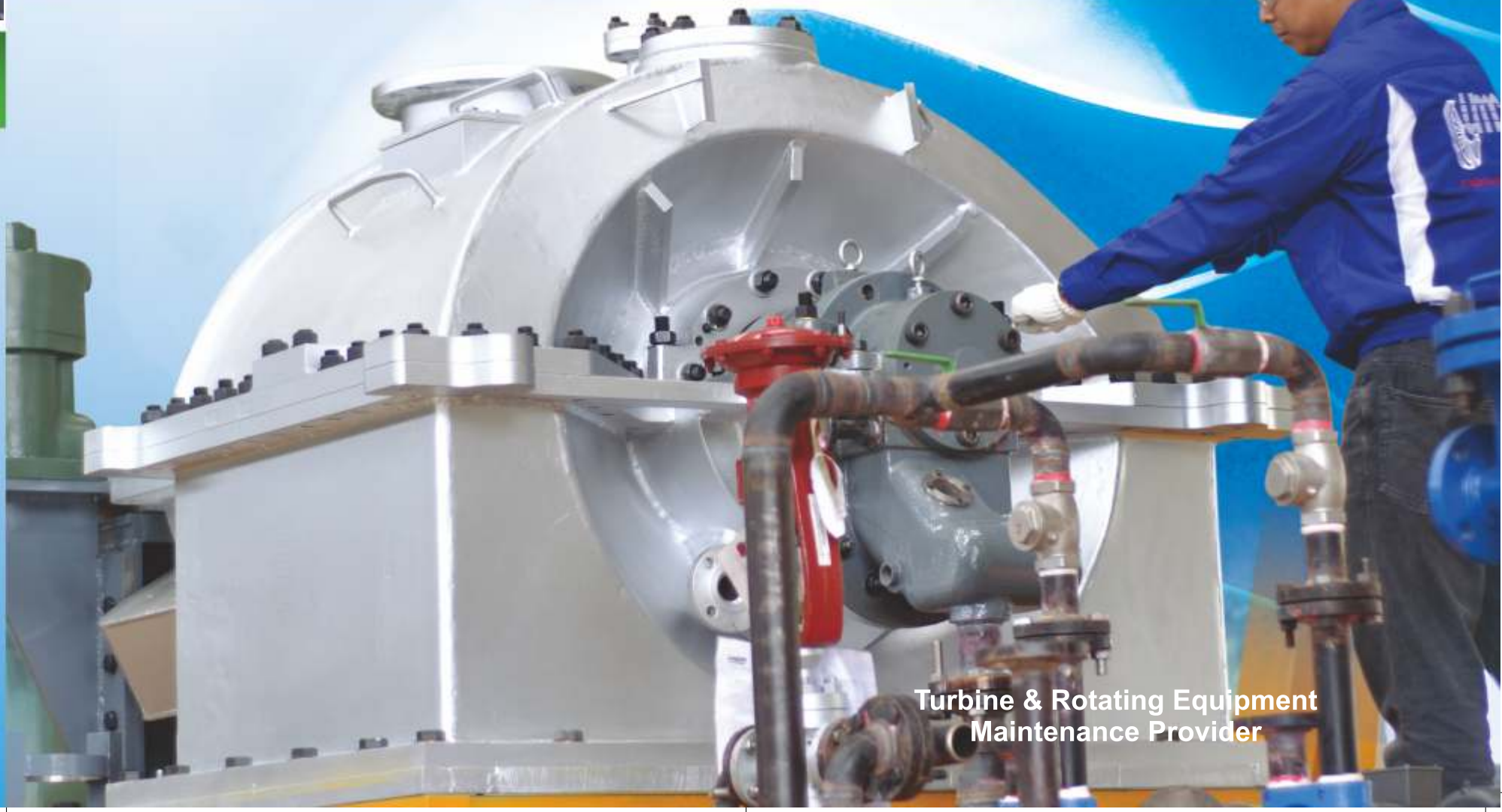
Turbine & Rotating Equipment Maintenance Provider